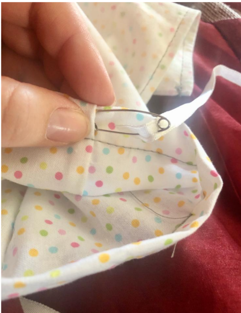
STEP 7: Cut your 1.5m of ribbon in half, Open the side seam between the channel to insert one half of the ribbon all the way around and back out of the exact same hole