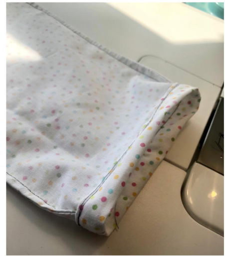
STEP 6: This shows turning over the top twice to encase it 1.25cm each, or again alternately you can overlock and stitch the channel down just once