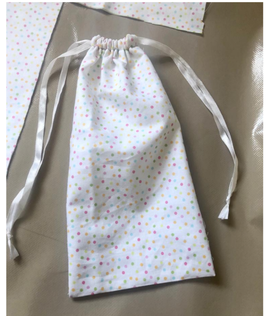
STEP 8: Complete this whole action on the other side seam, pull all 4 pieces of ribbon evenly then knot and snip the two matching sides to finish